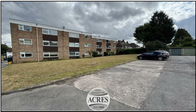
Hermes Court, Clarence Road, Sutton Four Oaks, Sutton Coldfield, B74 4AR