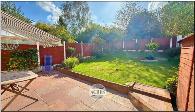
Hook Drive, Four Oaks