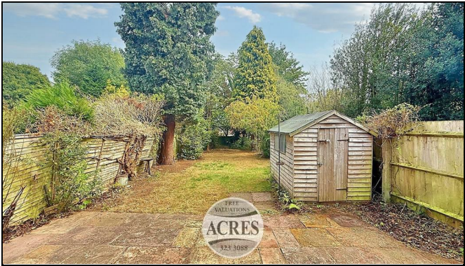
Blackberry Lane, Sutton Coldfield, B74 4JH