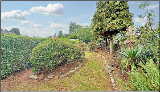
Clarence Road, Sutton Four Oaks, Sutton Coldfield, B74 4LP