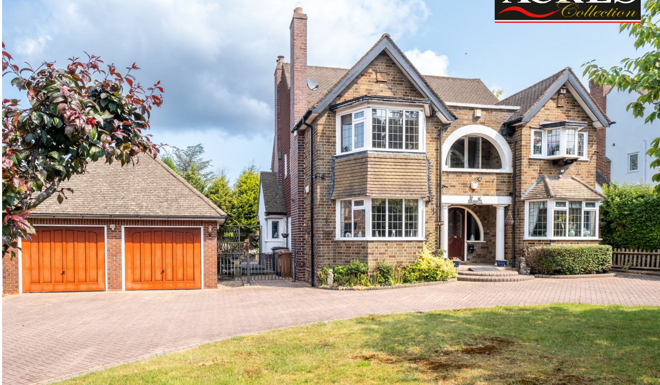
THE SQUIRRELS, TALBOT AVENUE, LITTLE ASTON, B74 3DD