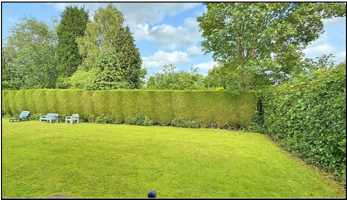
Oak Park Court, Walsall Road, Sutton Four Oaks, Sutton Coldfield, B74 4QY