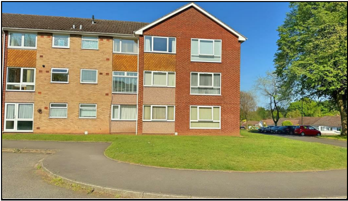
Sutton Court, Little Sutton Lane, Four Oaks