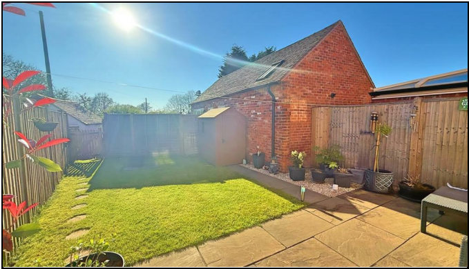
Lamb Farm Barns, Slade Road, Canwell