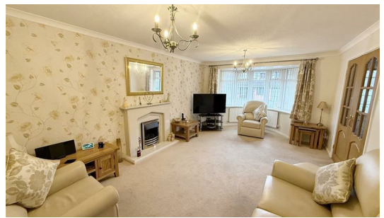
CHESTNUT CLOSE, STREETLY, B74 3EF - OFFERS OVER £535,000