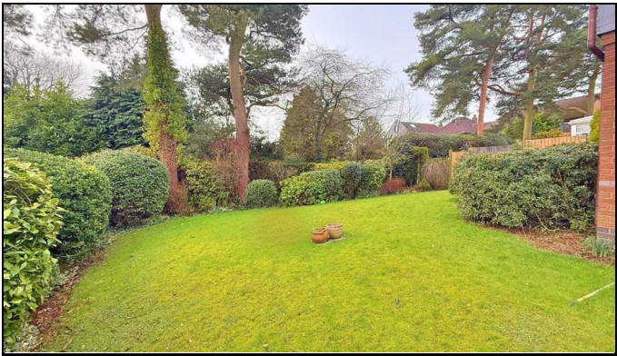
The Dovecotes, Sutton Coldfield, B75 5DN