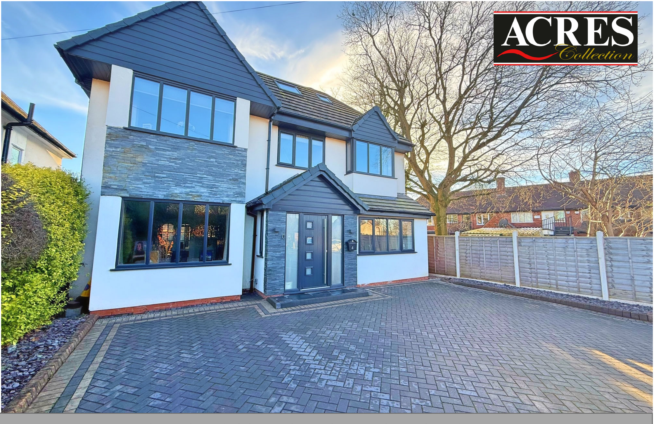
4 FOUR OAKS COMMON ROAD, FOUR OAKS B74 4NJ