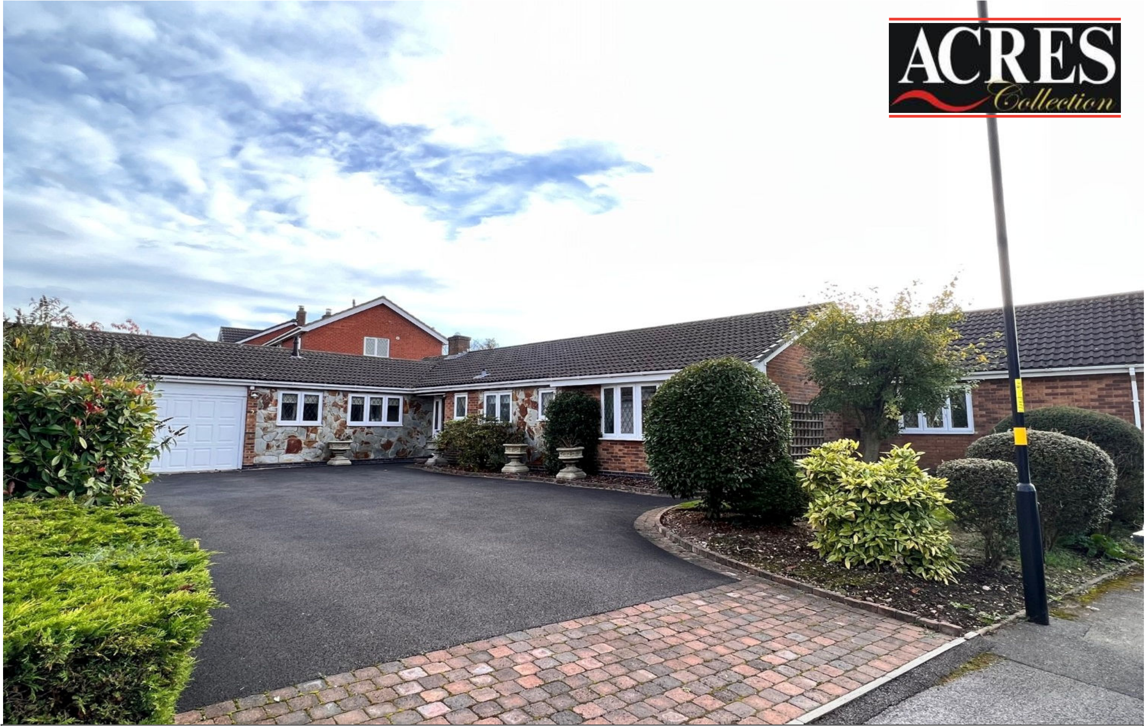
2 NETHERSTONE GROVE, FOUR OAKS B74 4DT