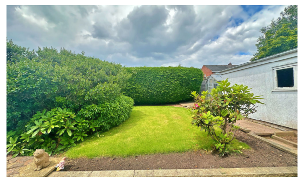
5 HAREWELL DRIVE, FOUR OAKS, B75 6RU - OFFERS AROUND £375,000