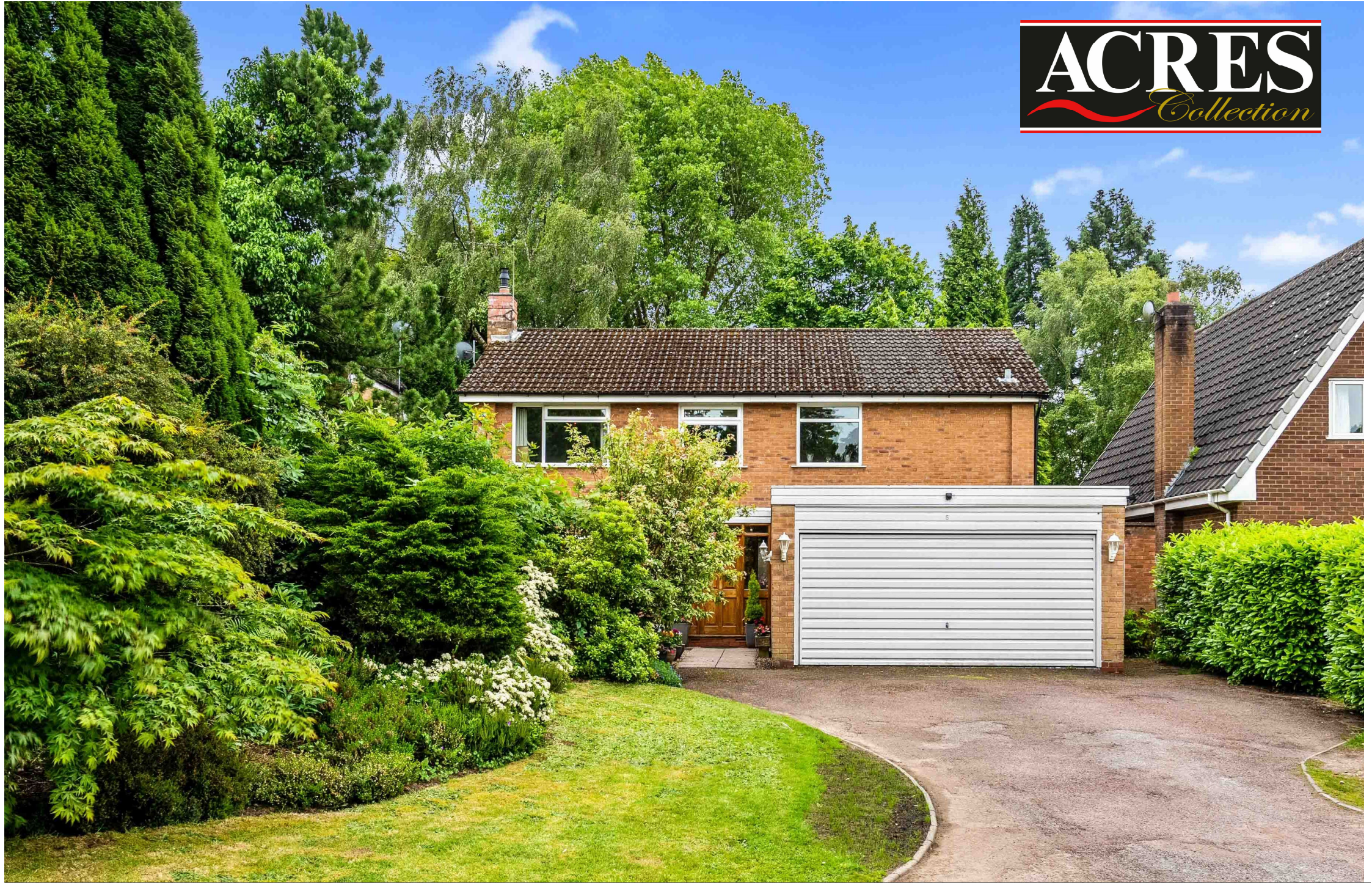
5 CLAVERDON DRIVE, LITTLE ASTON PARK, B74 3AH