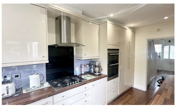
3 WORCESTER LANE, FOUR OAKS, B75 5NA - OFFERS AROUND £450,000