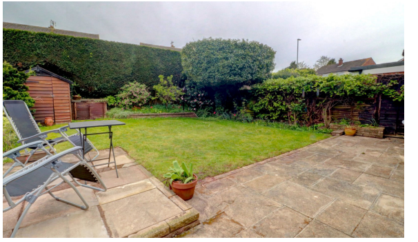
3 CHERRYWOOD ROAD, STREETLY, B74 3RT - OFFERS AROUND £350,000