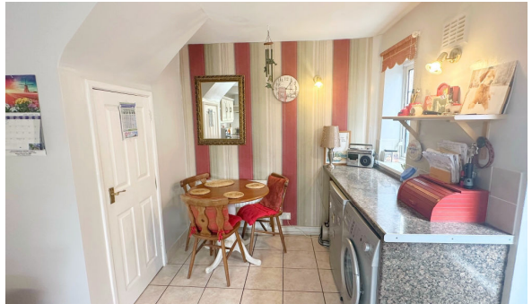
225a BIRMINGHAM ROAD, SHENSTONE WOOD END, WS14 OPD - OFFERS OVER £425,000