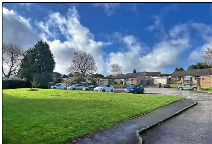
Hermes Court, Clarence Road, Four Oaks