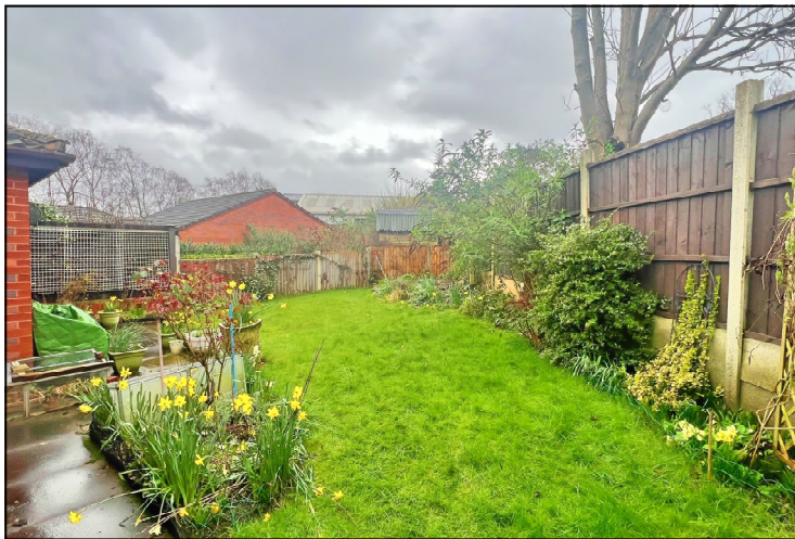
St Georges Court, Sutton Coldfield, B74 4LL