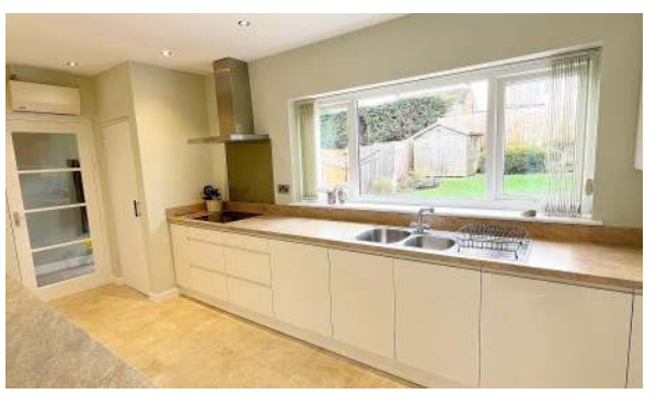
33 SHEPHERDS POOL ROAD, FOUR OAKS, B75 6NB - OFFERS AROUND £665,000