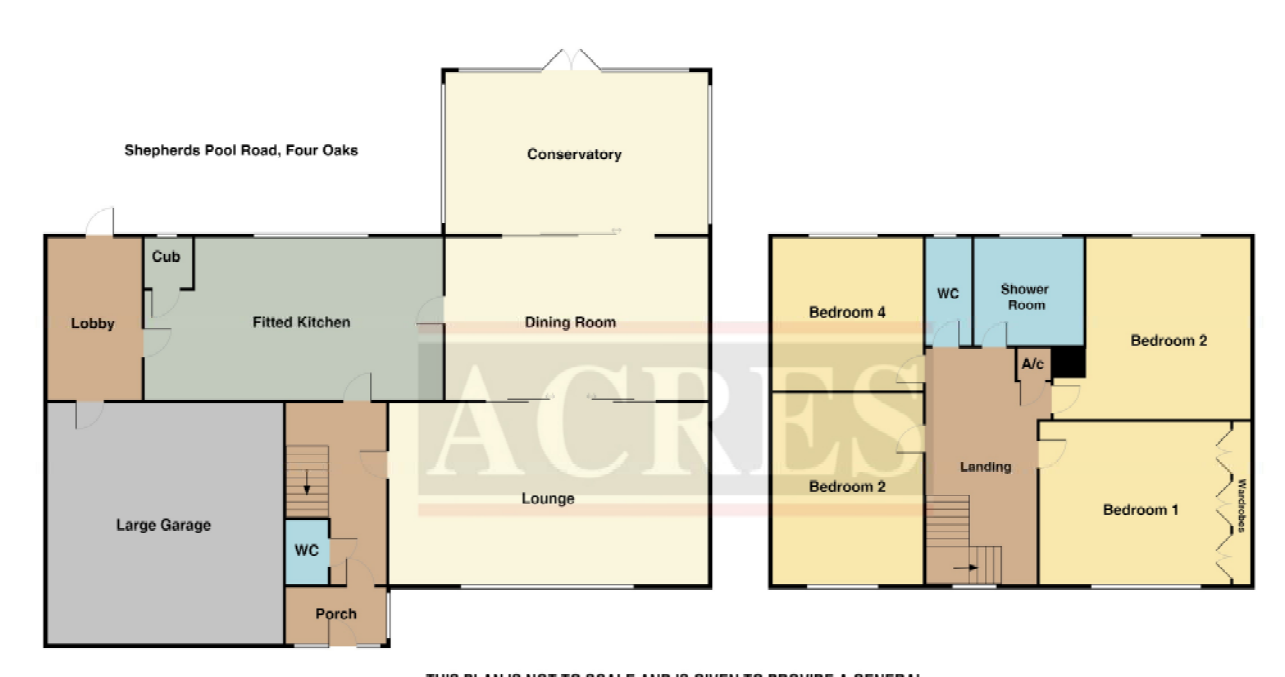
THIS PLAN IS NOT TO SCALE AND IS GIVEN TO PROVIDE A GENERAL GUIDE. IT MERELY INDICATES APPROXIMATE RELATIONSHIP OF ONE ROOM TO ANOTHER.