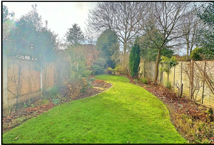
Little Aston Lane, Little Aston, Sutton Coldfield, B74 3UA