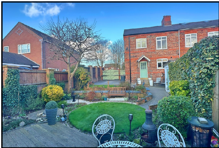
Hill Hook Road, Four Oaks