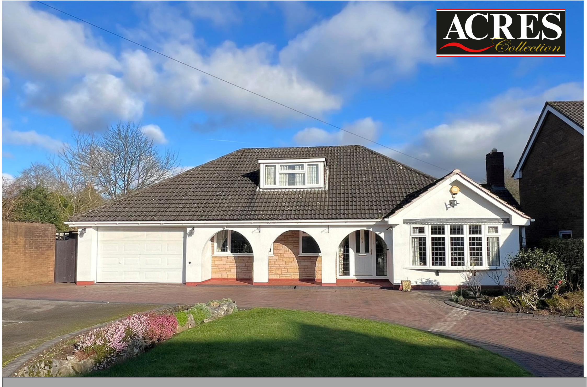
4 ALSTON CLOSE, FOUR OAKS, B74 2XZ