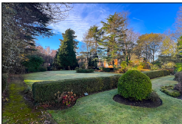
Cherryl House, Seymour Gardens, Four Oaks