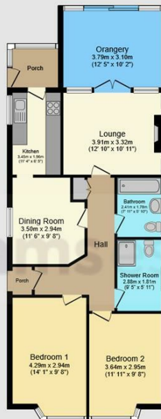
Floor Plan Floor area 94.8 m 2 (1,020 sq.ft.)