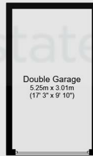
Garage Floor area 15.8 m 2 (170 sq.ft.)