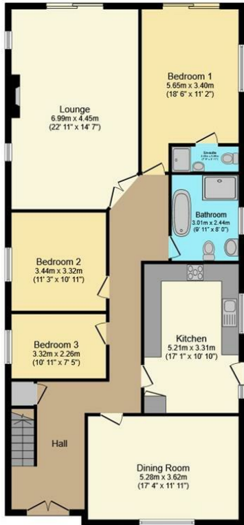
Ground Floor Floor area 140.8 m 2 (1,515 sq.ft.)