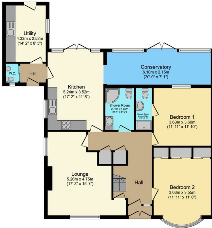
Ground Floor Floor area 119.7 m 2 (1,289 sq.ft.)