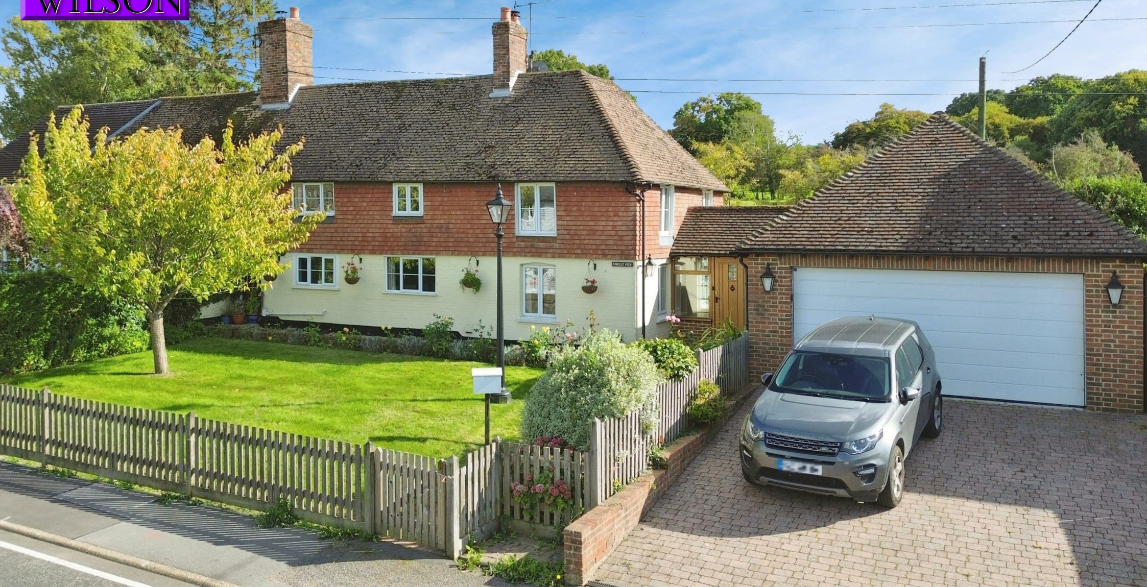
Knelle View, Main Street, Beckley, East Sussex, TN31 6RG. £550,000 Freehold