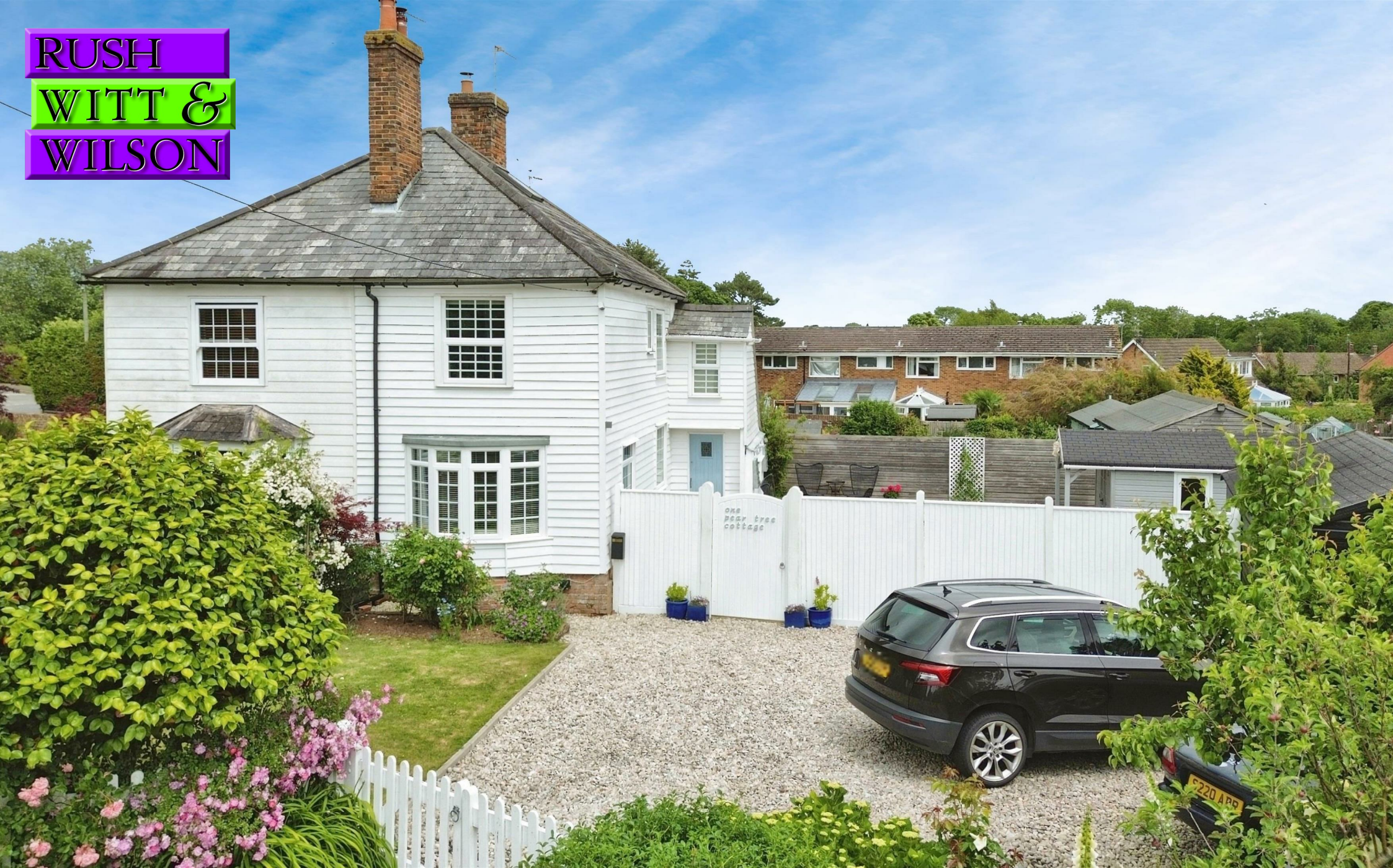
1 Pear Tree Cottage, Main Street, Northiam, East Sussex, TN31 6LG. £389,950 Freehold