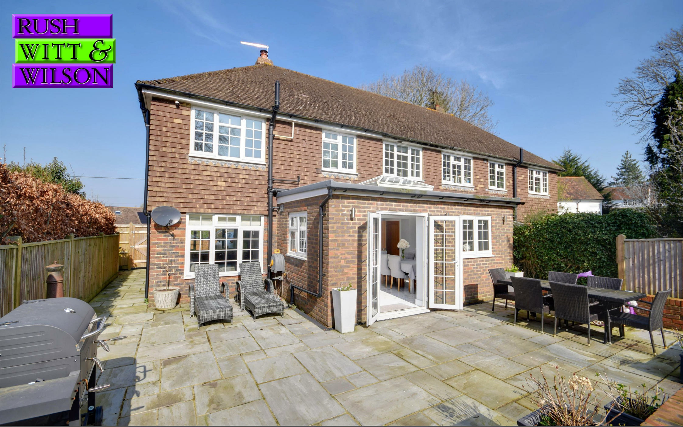
Weald Cottage, Main Street, Beckley, East Sussex, TN31 6TL. £495,000 Freehold