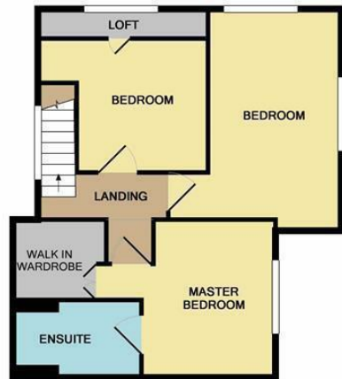
1ST FLOOR APPROX. FLOOR AREA 529 SQ.FT. (49.1 SQ.M.)