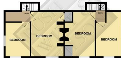
OUTBUILDINGS 770 sq.ft. (71.6 sq.m.) approx.