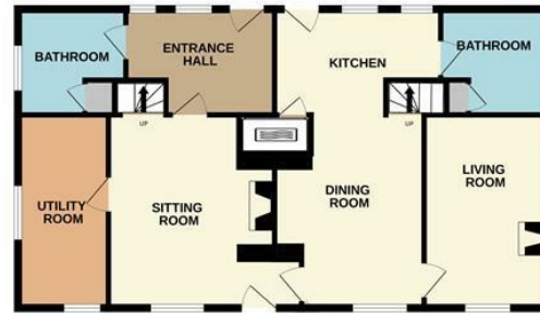
1ST FLOOR 523 sq.ft. (48.6 sq.m.) approx.