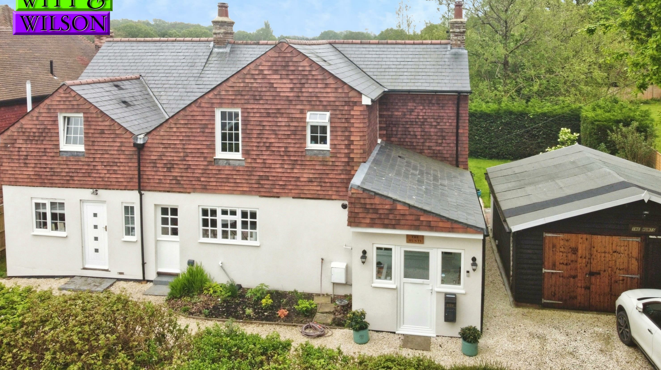
The Hunts, Coppards Lane, Northiam, East Sussex, TN31 6QN. £750,000 OIEO