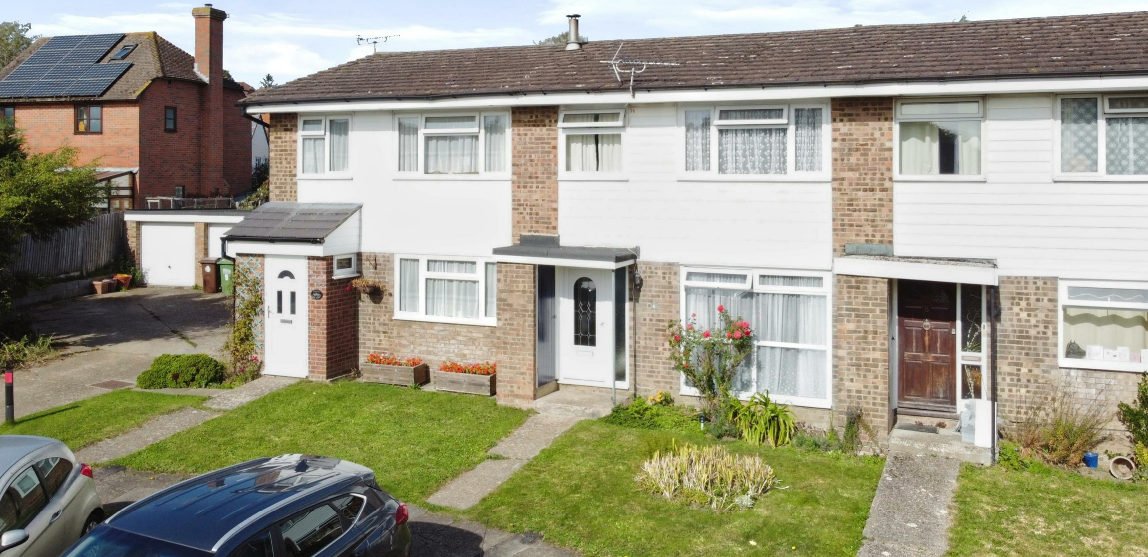
6 The Paddock, Northiam, East Sussex, TN31 6QF. £299,950 Freehold