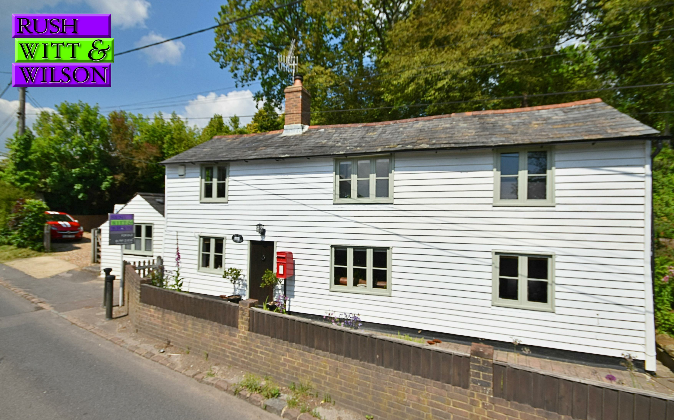
Old Post Cottage, Cackle Street, Brede, East Sussex, TN31 6EA. £450,000 Freehold