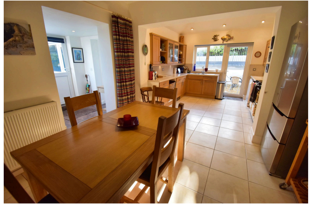
Fonthill, Sandyhill Road, Saundersfoot