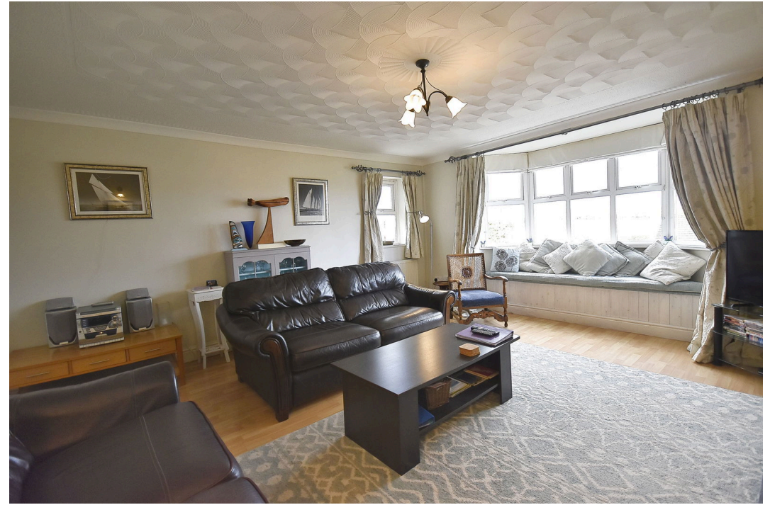
Retreat Road, Penally, SA70 7PL