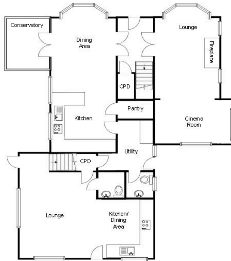
The Lodge - Ground Floor For illustrative purposes only, not to scale.