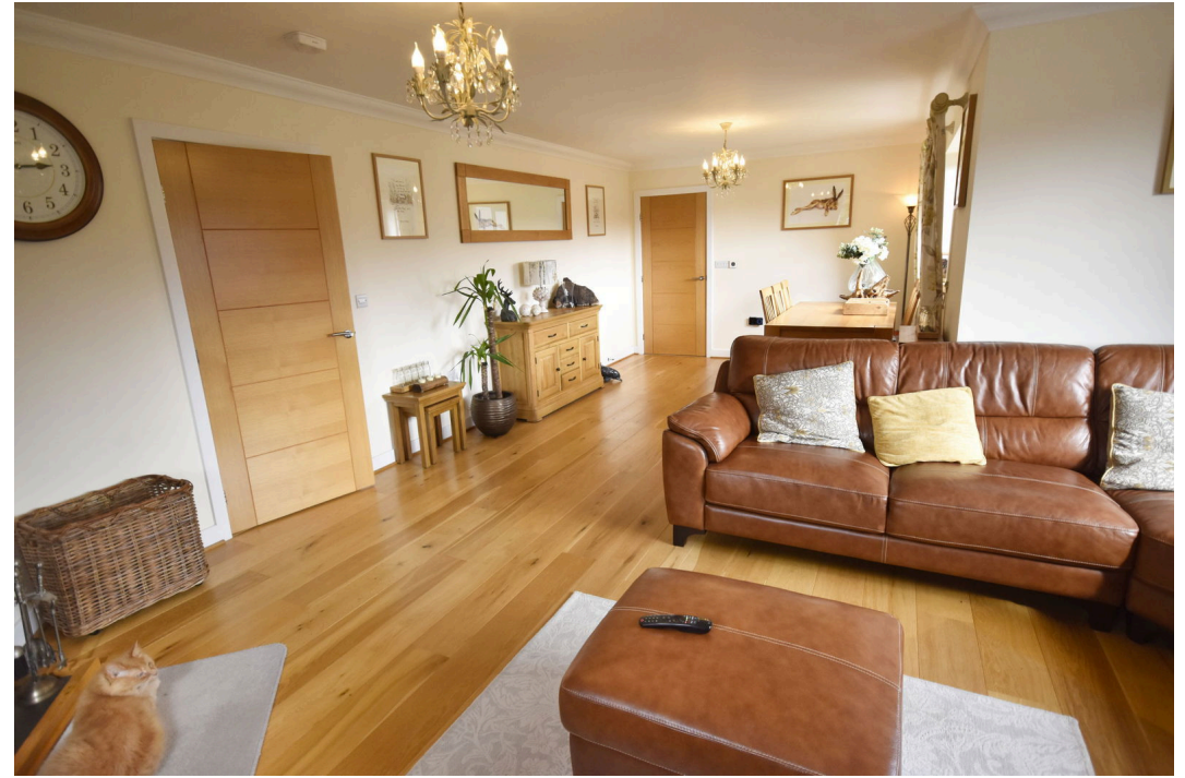
14 Ocean Point, Saundersfoot