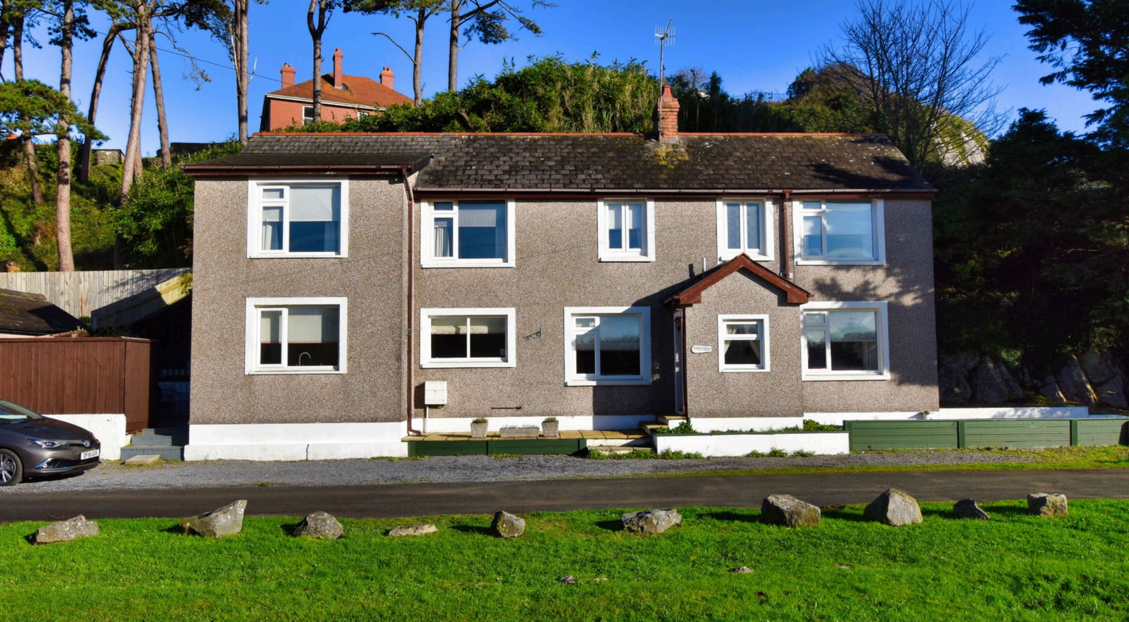
Maytree Cottage, The Burrows, Tenby