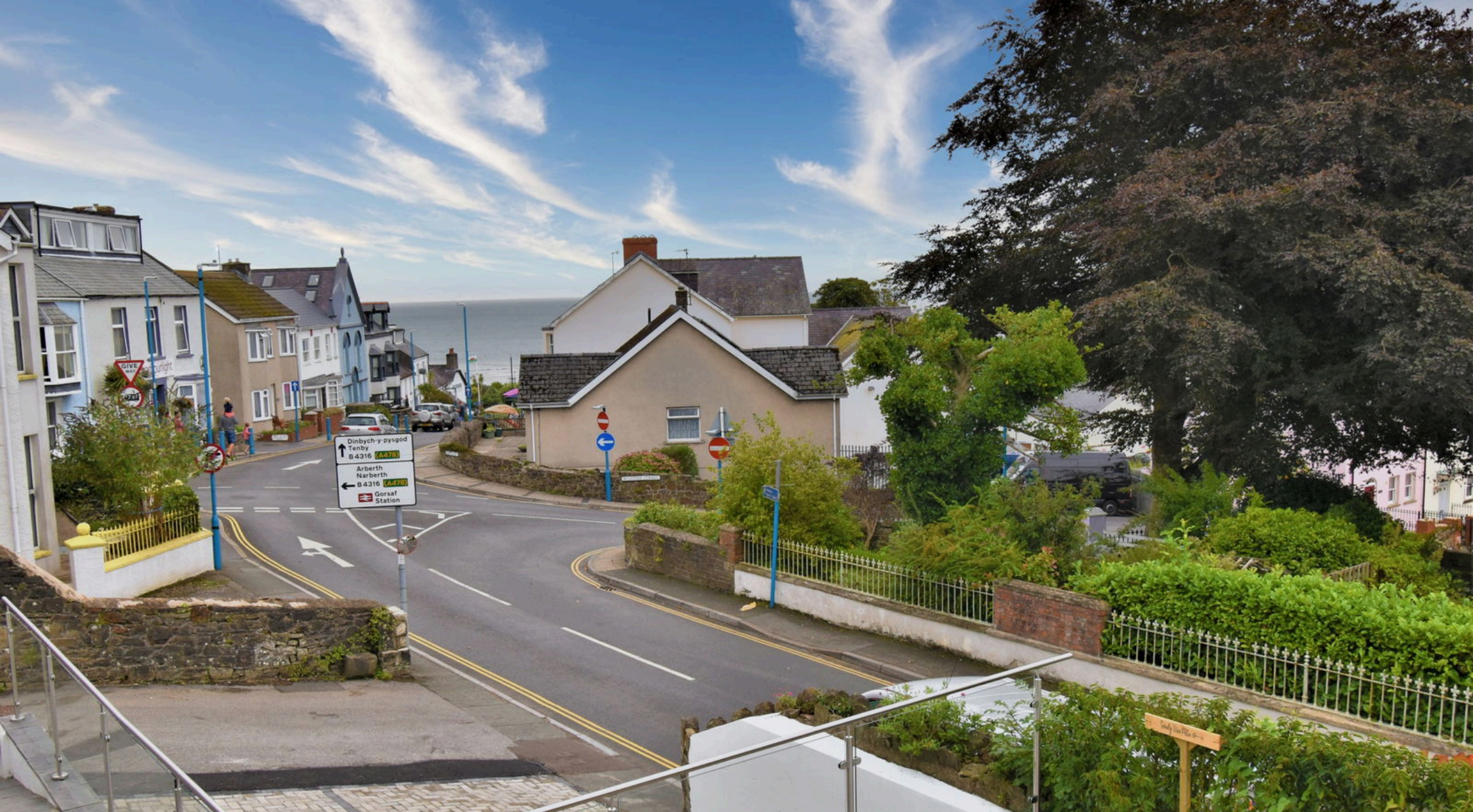
Fisherman's Rest, Harbour Heights, The Ridgeway, Saundersfoot