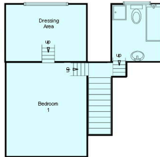
First Floor For illustrative purposes only, not to scale.