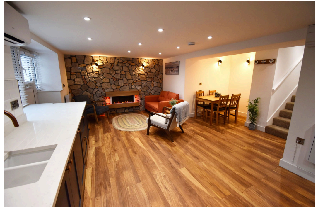
Fisherman's Rest, Harbour Heights, The Ridgeway, Saundersfoot