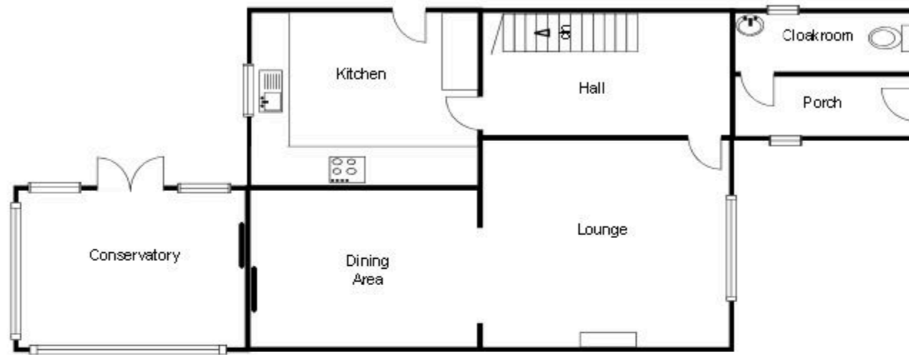
Ground Floor For illustrative purposes only, not to scale.