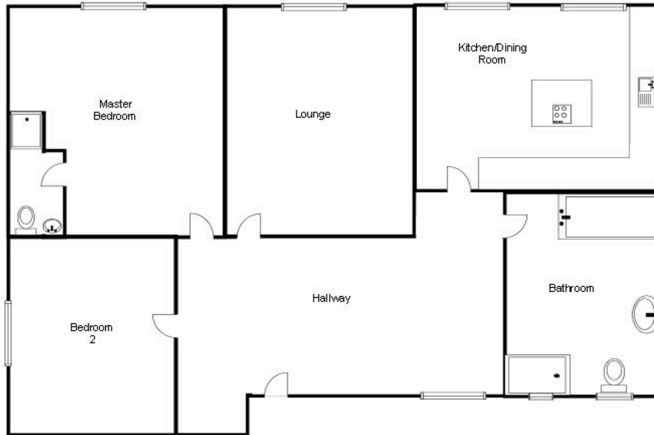
4 Gunfort Mansions For illustrative purposes only, not to scale.