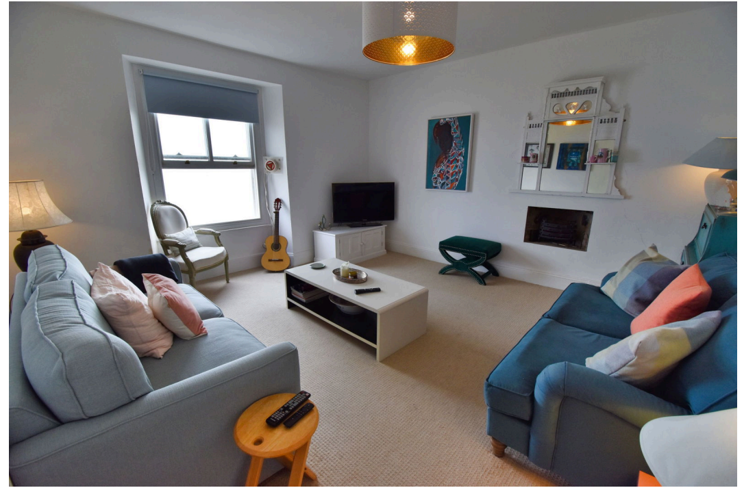
Flat 4 Gunfort Mansions, Cresswell St, Tenby Seafront