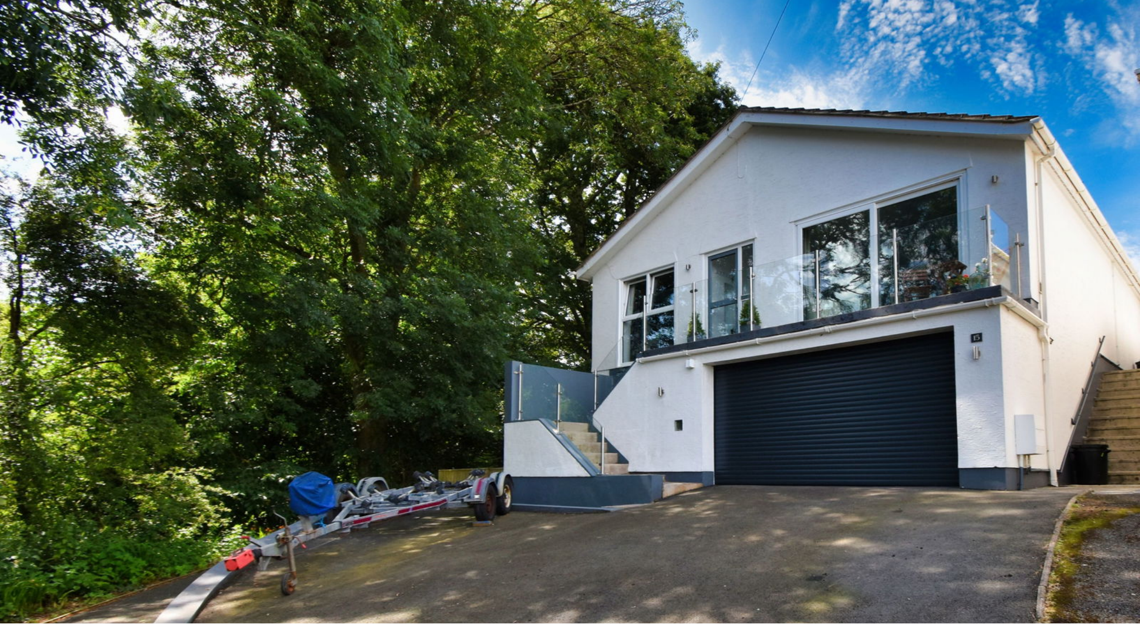
15 Scandinavia Heights, Saundersfoot

PRICE REDUCED Offers In The Region Of £499,000