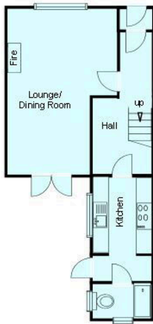
Ground Floor For illustrative purposes only, not to scale.