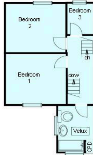
First Floor For illustrative purposes only, not to scale.