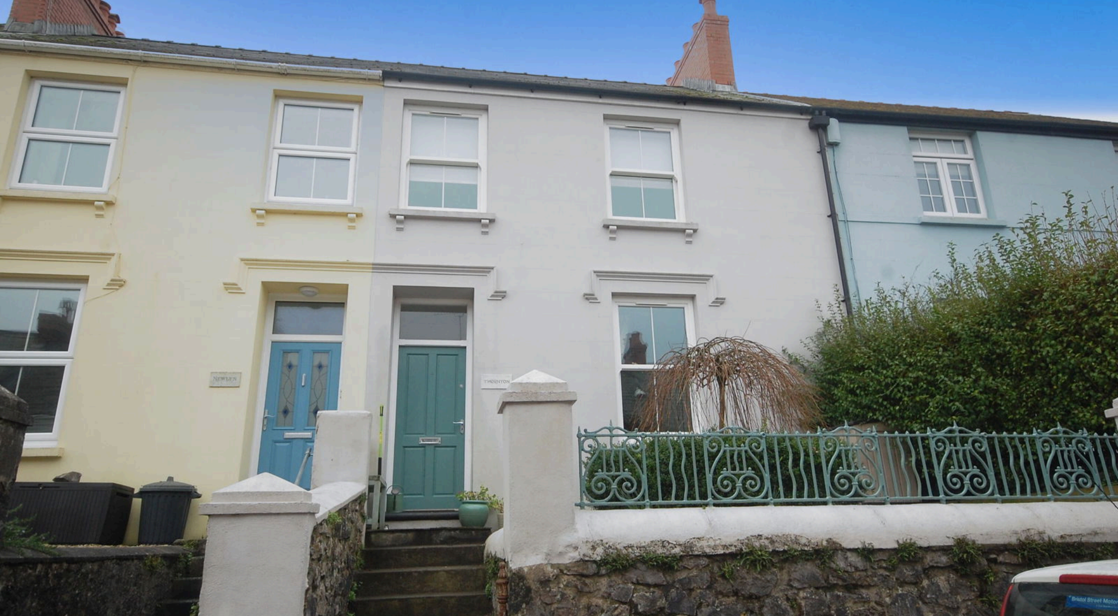
Thornton, Park Place, Tenby