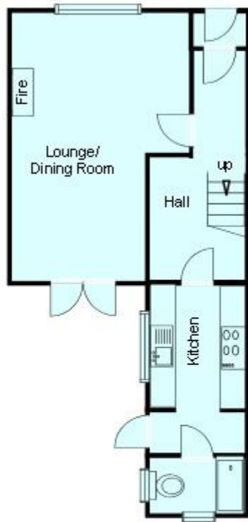
Ground Floor For illustrative purposes only, not to scale.