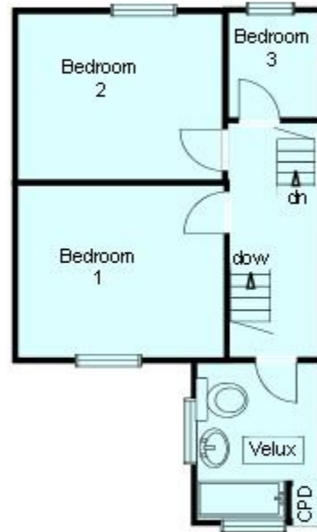
First Floor For illustrative purposes only, not to scale.