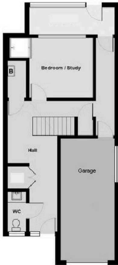
Ground Floor For illustrative purposes only, not to scale.