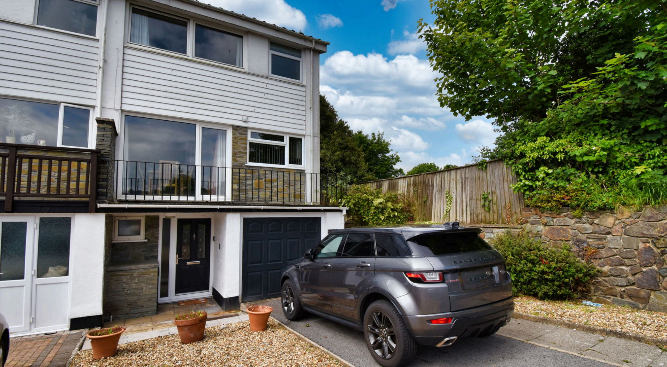
Llain-Y-Delyn, 1 Rosemount Gardens, Tenby