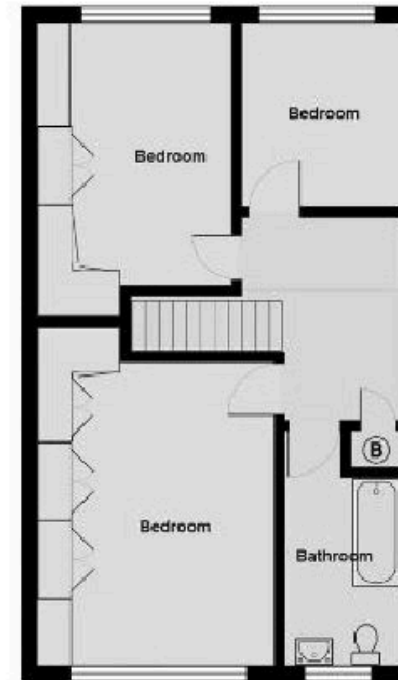
Second Floor For illustrative purposes only, not to scale.