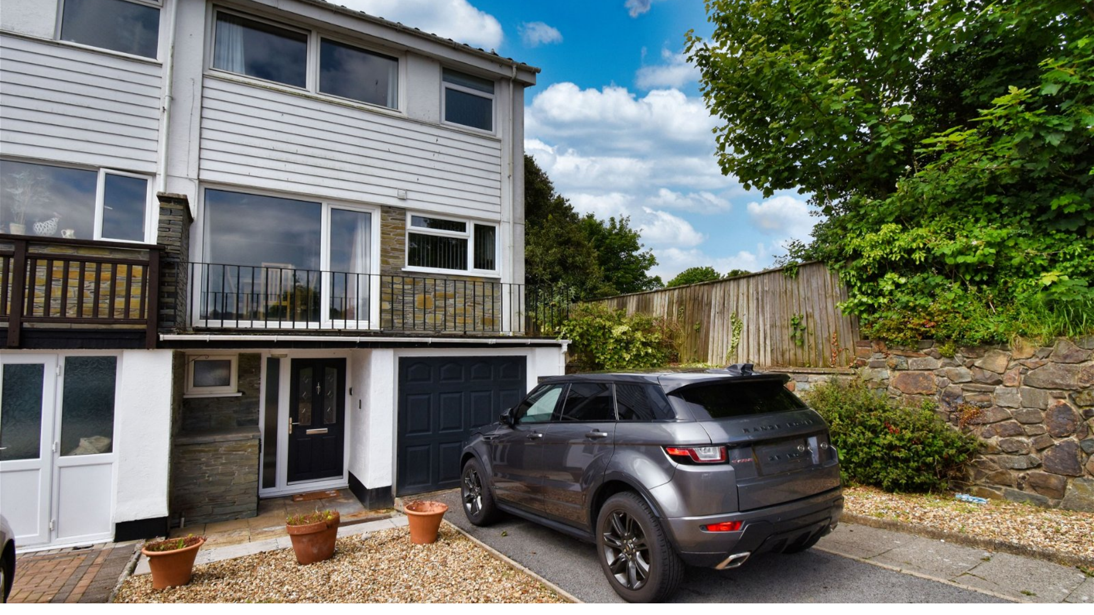
Llain-Y-Delyn, 1 Rosemount Gardens, Tenby