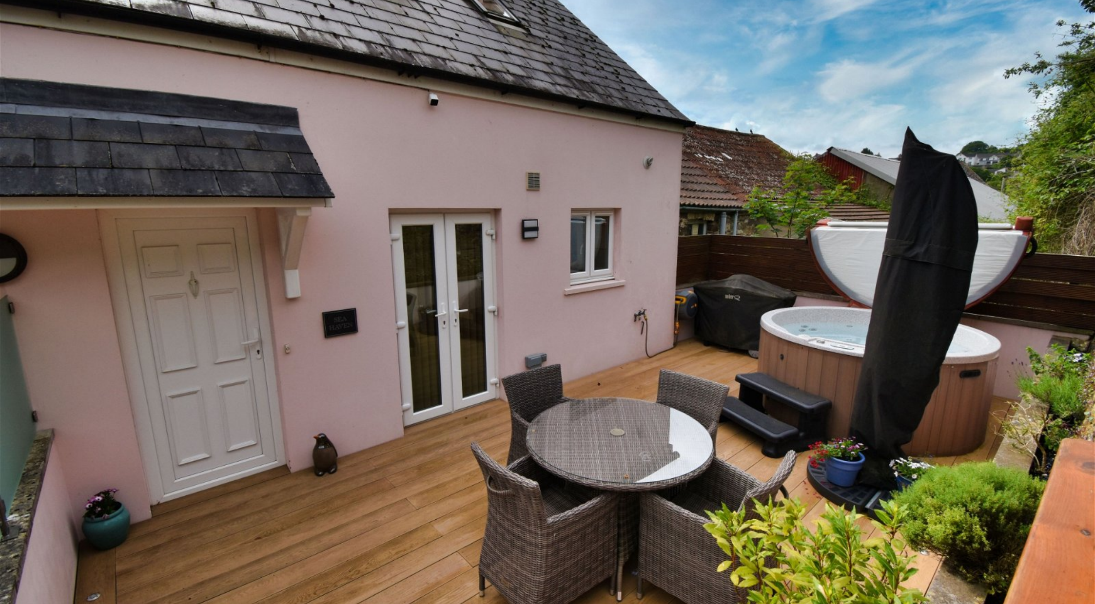
Sea Haven, 1 London House, The Strand, Saundersfoot