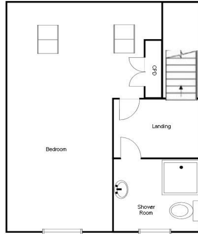
First Floor For illustrative purposes only, not to scale.